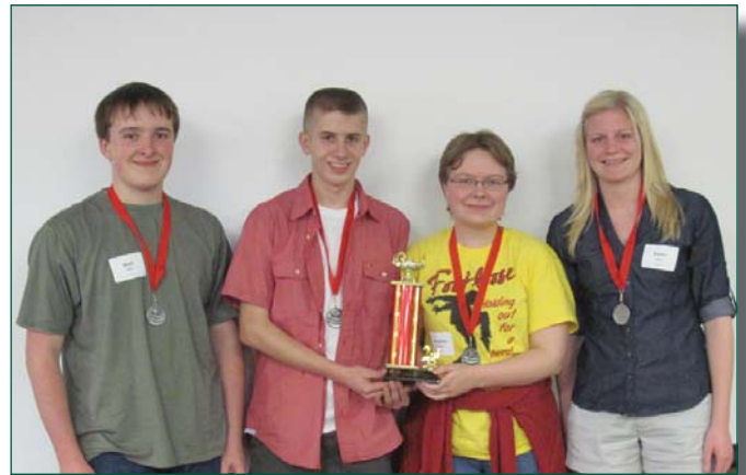
Chatfield .....12 th