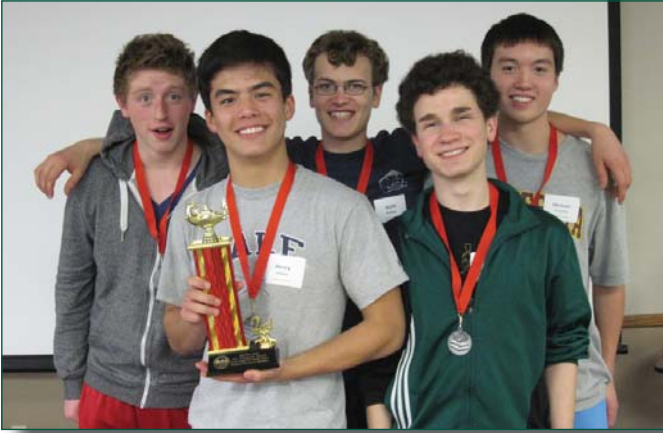
Rochester Mayo .....3 rd