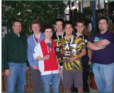
Rochester Mayo High School team stands proudly after receiving their medallions for 3 rd place. They have placed the past two years!

The top three teams from tier A and top two teams from tier AA advanced to the State Knowledge Bowl Competition. The event was held April 12-13 at Cragun's Conference Center in Brainerd.