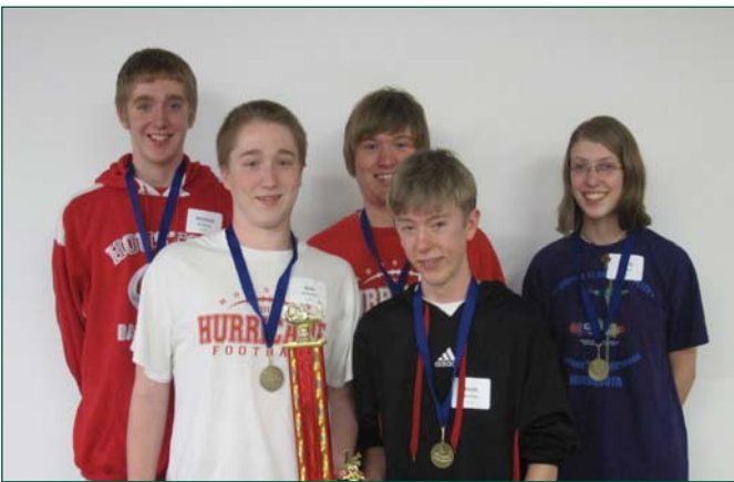
Houston .....14 th

Teams from southeast Minnesota made a great showing at 2012 State! Teams from Chatfield, Dover-Eyota, and Houston represented Tier A. Teams from Northfield and Rochester Mayo represented Tier AA.