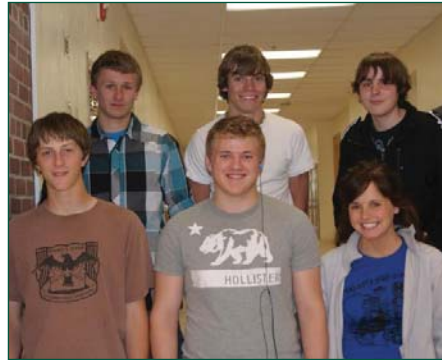
Members of Randolph High's Communications Arts class

The class is currently putting together a video that will include a logo and project created by each student that they will share on the course website. Members of the school board have visited the