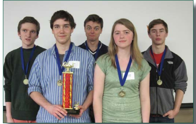
Northfield .....12 th