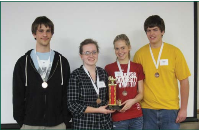
Dover-Eyota .....11 th