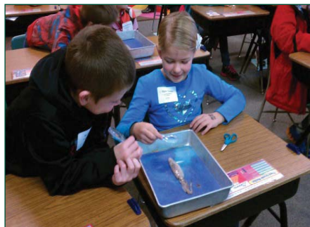
Students participating in one of the conference's hands-on sessions.

All students took part in a keynote address from the