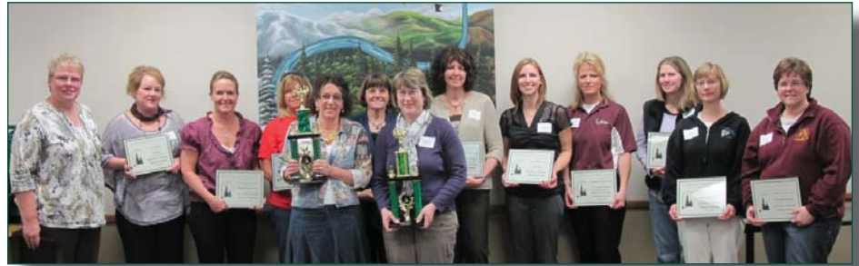
SSC Member vs. Member Walking Challenge Coordinators display their organizations' awards for participating in the January, 2012 challenge.

Beginning January 1, participants will start wearing a pedometer and tracking their steps. Step counts are turned in to the person designated to keep track of steps at their organization (most likely the person in charge of the organization's wellness programming). Coordinators then send in the step totals and