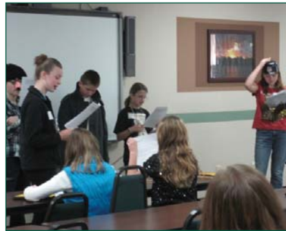
Students participating in one of the conference's sessions.

The goal of the conference was to expose students to writing and illustrating as an art form, and to provide students an opportunity to express themselves in a positive and creative way. Students participated in four 55-minute sessions. Topics included bookmaking, storytelling and