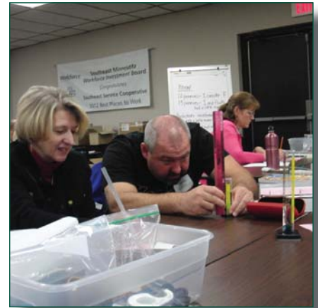
Math cohort members participate in one of many hands on activities offered at the October 23 MSTP math programming session.