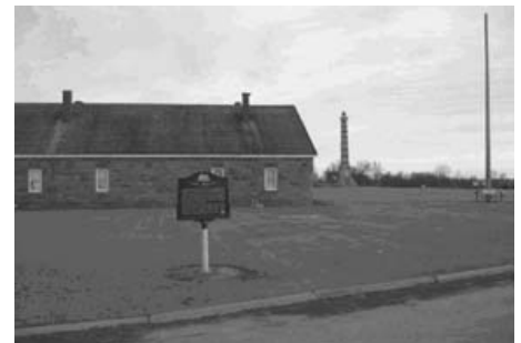
Fort Ridgely Historical Site, near Fairfax, MN

deadline is April 1st. This is a unique opportunity to immerse yourself in Minnesota history as it relates to our nation's history, and to facilitate student research using primary sources. So