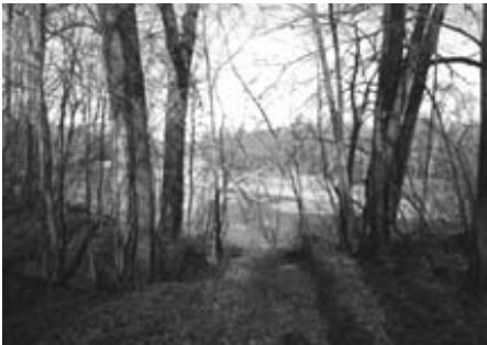
The Minnesota River, at the Lower Sioux Agency Historical Site near Morton, MN

How much do you know about the US-Dakota Conflict of 1862? What were the real causes of it? What was it like to be a settler living in Acton, unaware of