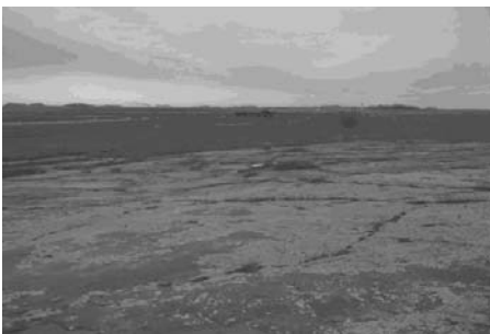
The Jeffers Petroglyphs near Comfrey, MN

Wouldn't it be fascinating to walk the land where these events happened as part of Minnesota's other civil war, then benefit from scholarly interpretation? That is exactly what is planned for the cohort's first Summer Institute in July 2007! What a great way to invigorate your teaching and take a fresh perspective back to your students.